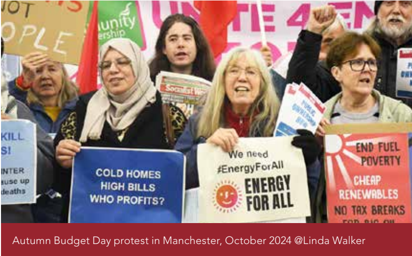
Autumn Budget Day protest in Manchester, October 2024

The advent of a Labour government made many people hope for a softening of relentless austerity policies and a hardening of controls over predatory corporate interests.