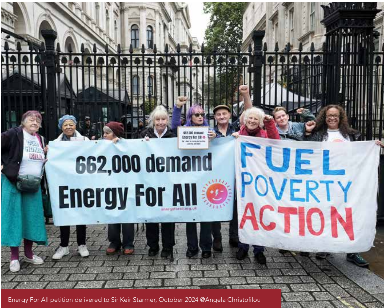
Energy For All petition delivered to Sir Keir Starmer, October 2024