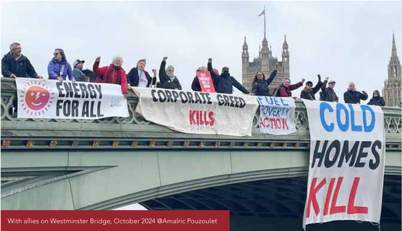
With allies on Westminster Bridge, October 2024