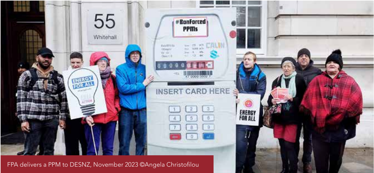
FPA delivers a PPM to DESNZ, November 2023