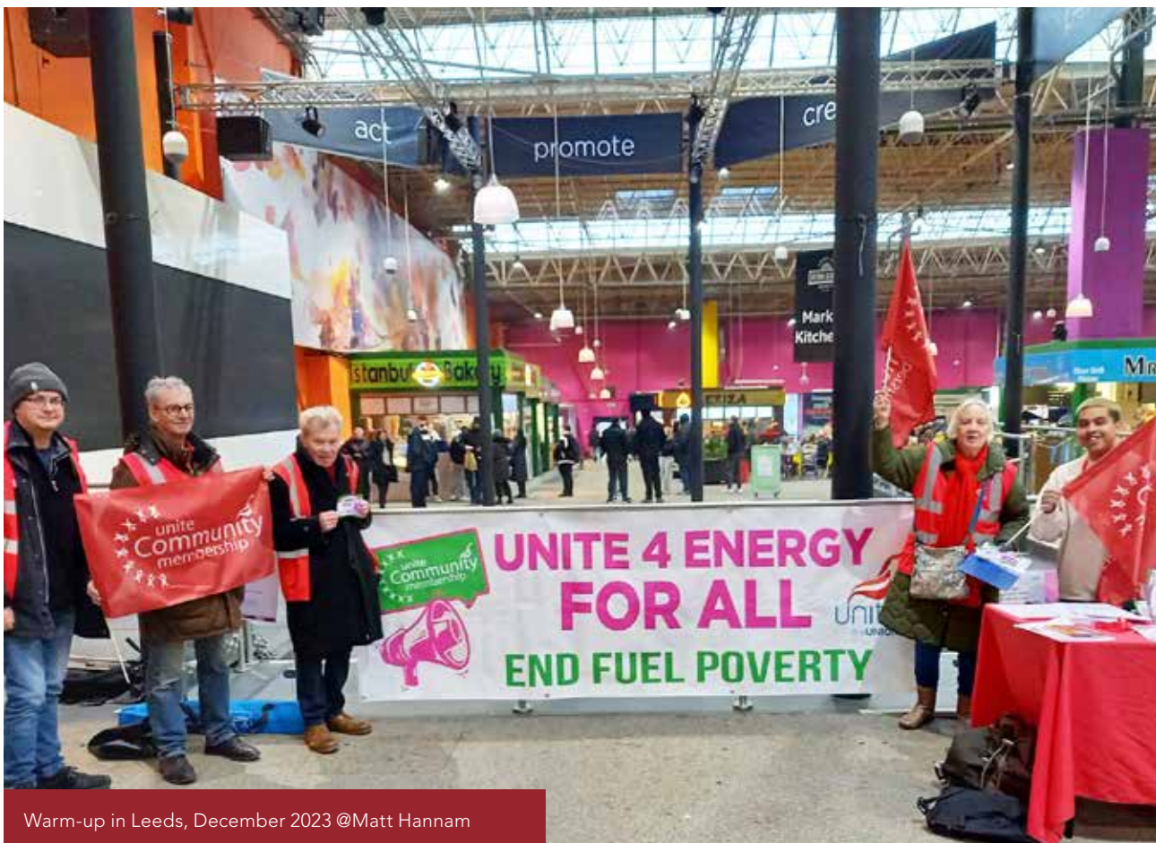
Warm-up in Leeds, December 2023