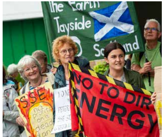
Demo against SSE in Perth, July 2024

Lambeth - In last year's Annual Report we noted that residents in Lambeth were facing price increases of 353% and threats of eviction when they were not able to keep up with their energy charges. This year, alongside London Tenants Federation, we helped residents start a new group – Lambeth Tenants Heat Campaign , to challenge the increases, prevent evictions, and fight for more efficient and reliable heat. Sixty-nine organisations