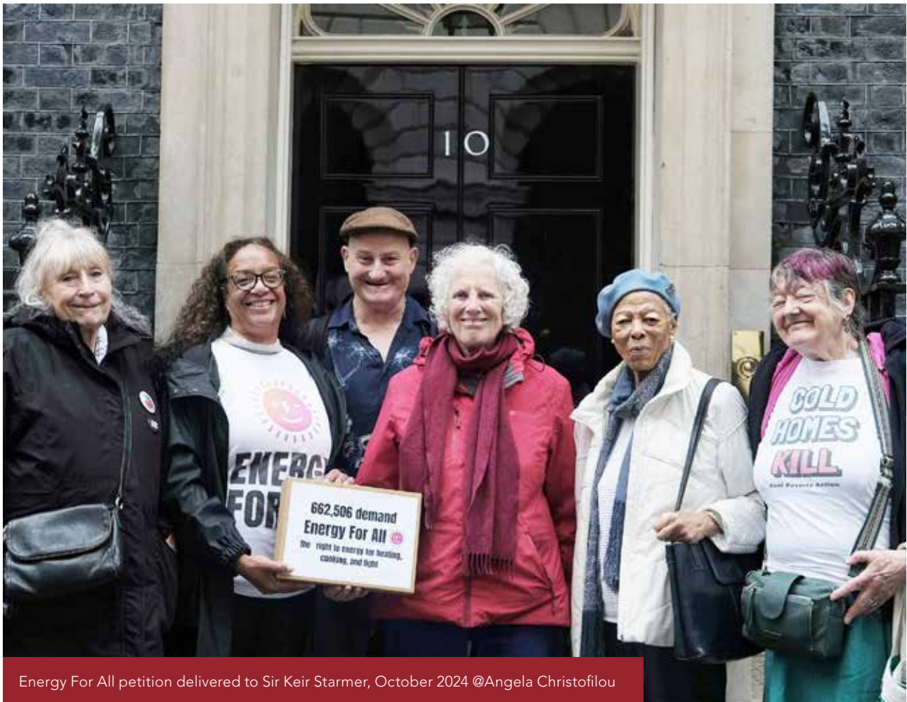
Energy For All petition delivered to Sir Keir Starmer, October 2024