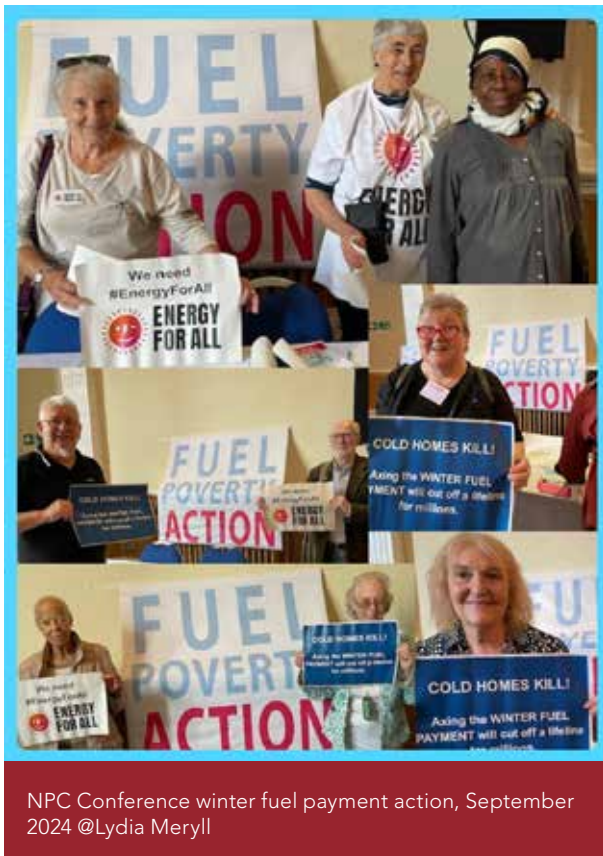
NPC Conference winter fuel payment action, September 2024