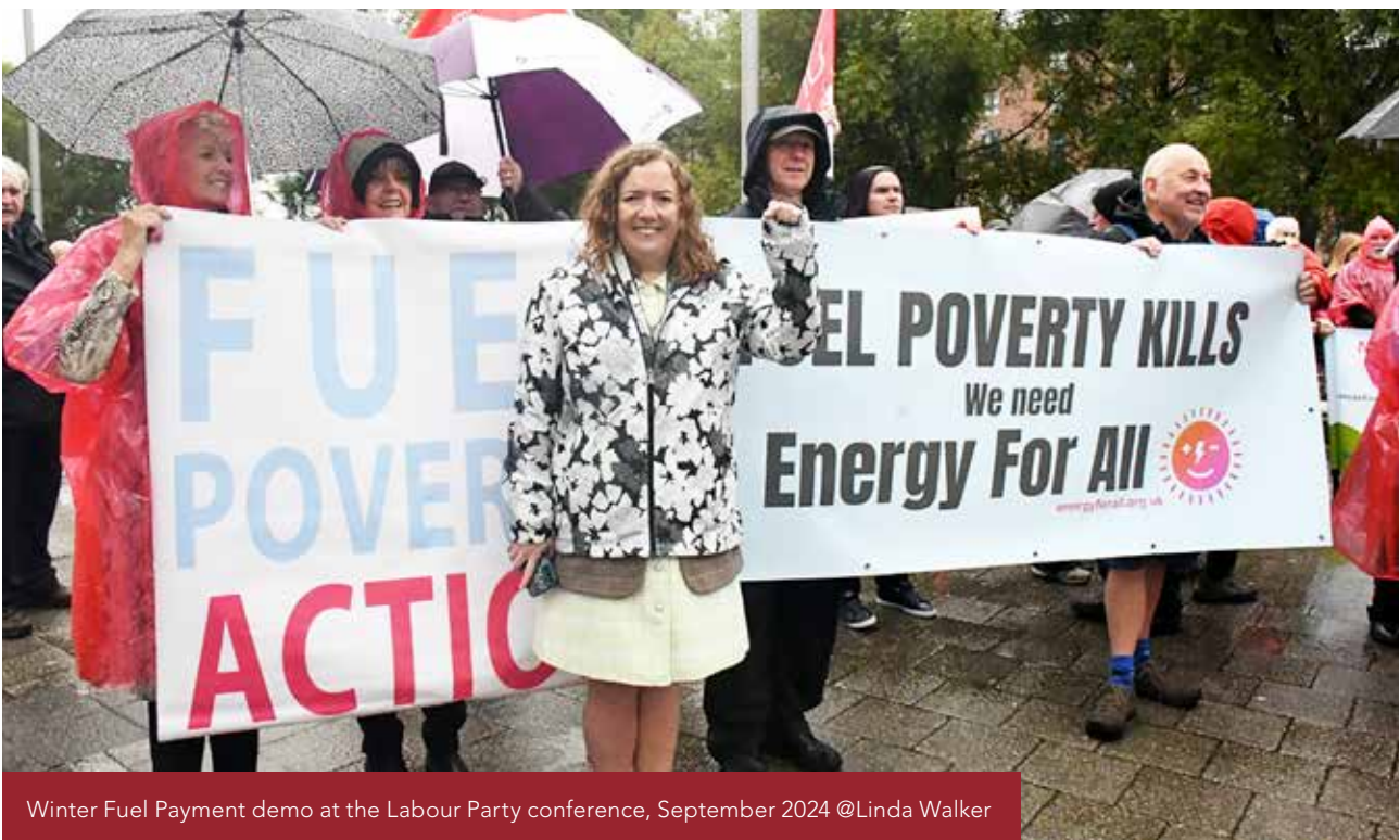
Winter Fuel Payment demo at the Labour Party conference, September 2024