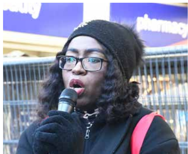
Spring Budget Day fuel poverty action in Manchester, March 2024

We have a busy year ahead, with plans to design, build and launch a new website, improve our internal communications and build on our recent social media success.