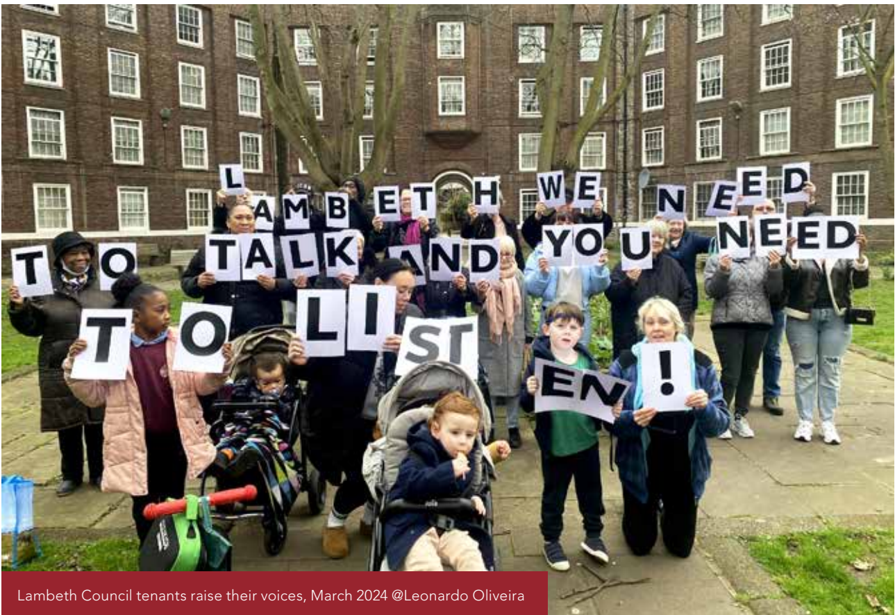
Lambeth Council tenants raise their voices, March 2024

The private rented sector – We have been lobbying government to make the fundamental changes needed to ensure that the millions of home upgrades deliver the safe warm affordable homes and heating that people desperately need. This includes those in private rentals where standards are especially low. Any grants landlords receive need to be contingent on protections for residents from any resulting rent increases or evictions after the