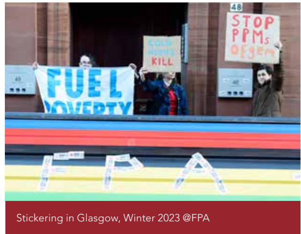
Stickers in Glasgow, Winter 2023