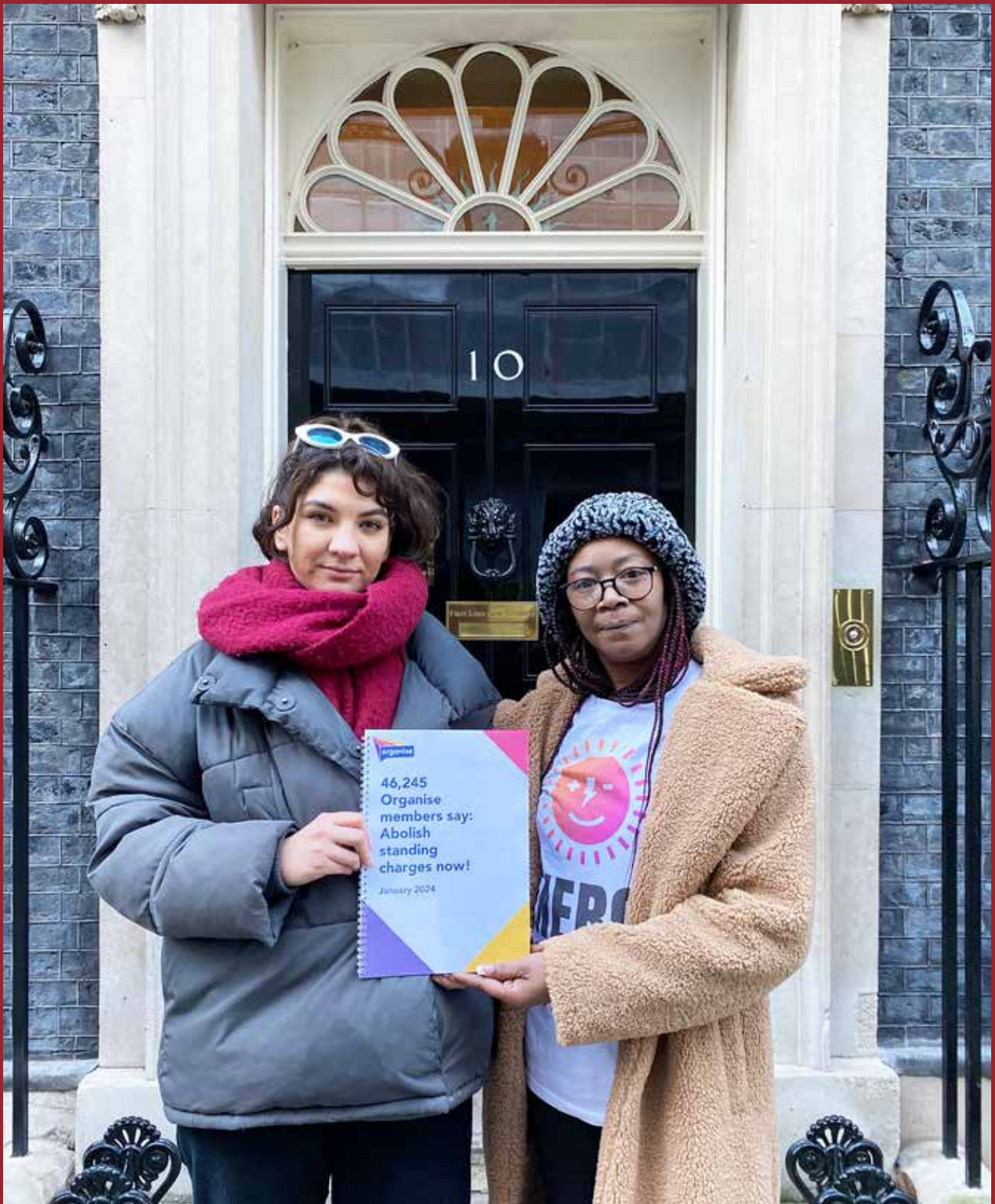
Petition hand-in to Rishi Sunak with Organise, January 2024