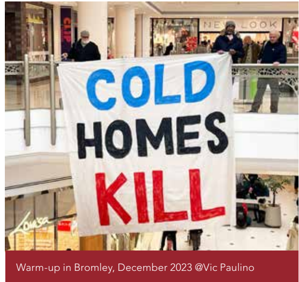
Warm-up in Bromley, December 2023

Ofgem and energy firms - we are facing a battle to ensure that pricing innovations supported by Ofgem and energy firms don't make things worse and increase energy inequality. New time-of-use tariffs mean energy can be cheap or free at certain times. The problem is that this cheap and free