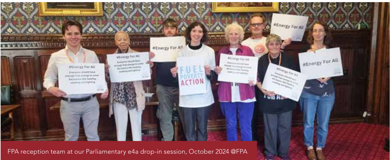
FPA reception team at our Parliamentary e4a drop-in session, October 2024

At the heart of this will be a regular newsletter and a new website with a bank of information for supporters that will include the membership handbook, our Theory of Change, sign-up forms, an events calendar and information about current campaigns.