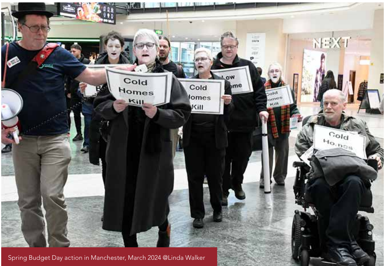
Spring Budget Day action in Manchester, March 2024

Response to Government Consultation: Heat Networks Zoning Regulation